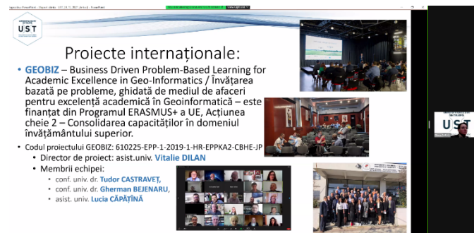
Presentation of the GEOBIZ Project results in 2021

and its implementation) and institutional development (strengthening of institutional capacity through involvement in some trainings/workshops/summer schools of the representatives of the Faculty of Geography in online and/or physical format; signature of Agreements of cooperation between UST and several business representatives etc.)