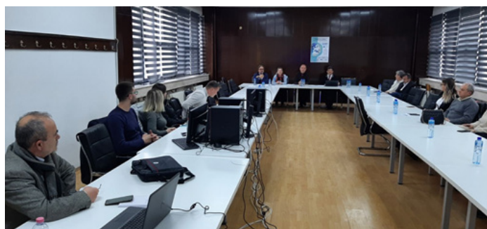
Business-academia workshop in Prishtina