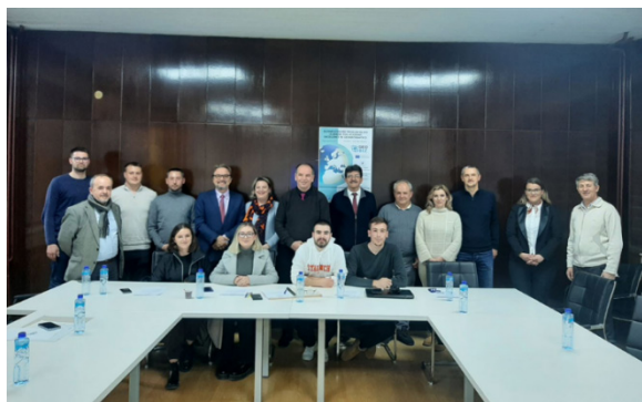
Business-academia workshop in Prishtina

Academia cooperation. The first topic was titled "System, mission, organization, mandate, coordination of emergency operations" where the activities from Emergency Management Agency and requests for geoinformation from various sources were presented.