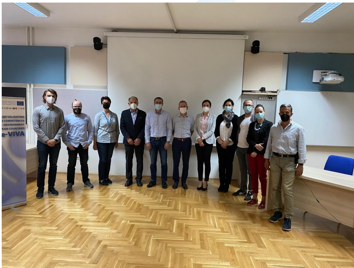
Joint picture of the meeting participants