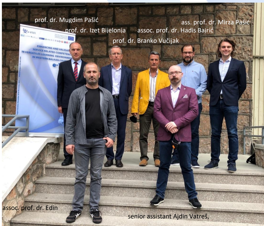
MEF UNSA eVIVA project team members

All documents per work packages produced by MEF UNSA were presented to NEO BH as well as web pages links of dissemination.