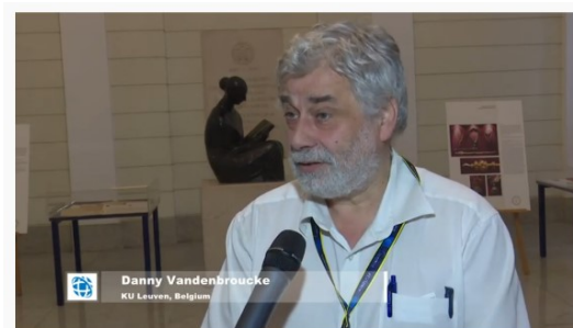
GEOBIZ project kick-off meeting in Zagreb

leader and deputy leader tasks of Work packages and Task groups. Definition of work schedule plan was made, and we Launch the first Task groups, and financial management sessions. Project web page and Moodle platform were also presented and launched. Although we worked hard all three days, we also found time for short joint dinner. We look forward to the new challenges ahead of us as part of the project, wish all partners a successful work and see you at the next workshop.