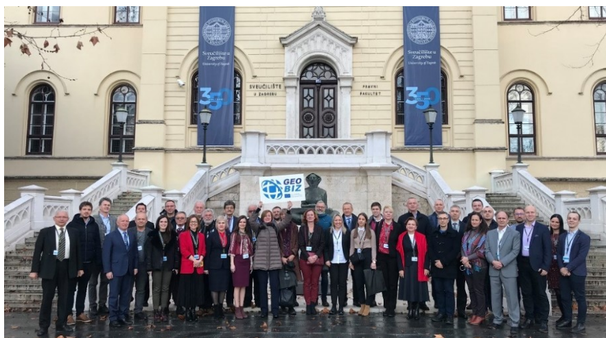
Joint photo of the kick-off meeting participants (Zagreb, February 4 th , 2020)