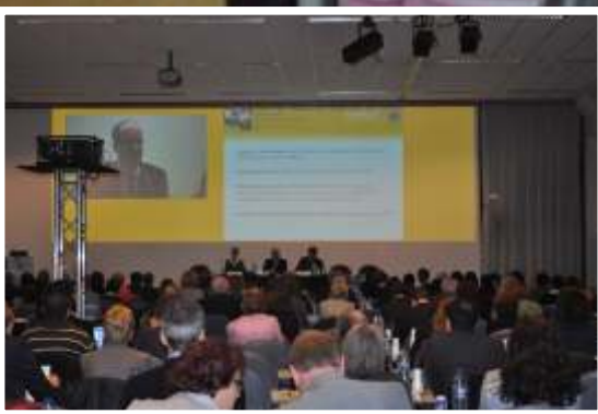
KONFERENCIJA U BRISELU BRUSSELS CONFERENCE