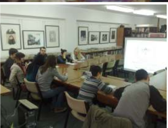
ERASMUS MUNDUS INFO DANI/DAYS